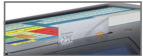
MAGNETIC CARD READER